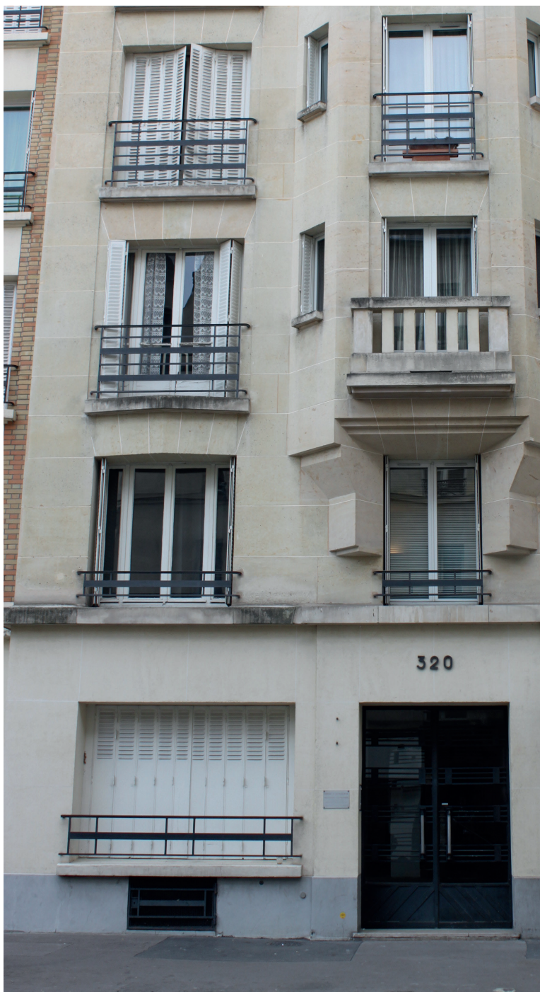
320 rue St Jacques from the street (present day).