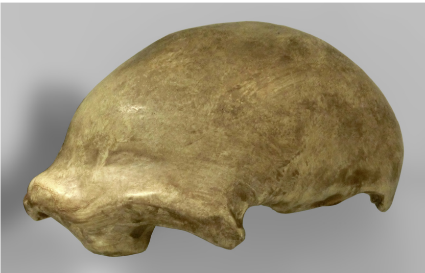
Figure 9.2: The cranium (known as Neanderthal 1) from the Neander valley that was derided as brutish by William King in 1864. Image of cast.

Considering that the Neanderthal skull is eminently simial, both in its general and particular characters, I feel myself constrained to believe that the thoughts and desires which once dwelt within it never soared beyond those of a brute. (King 1864: 96)