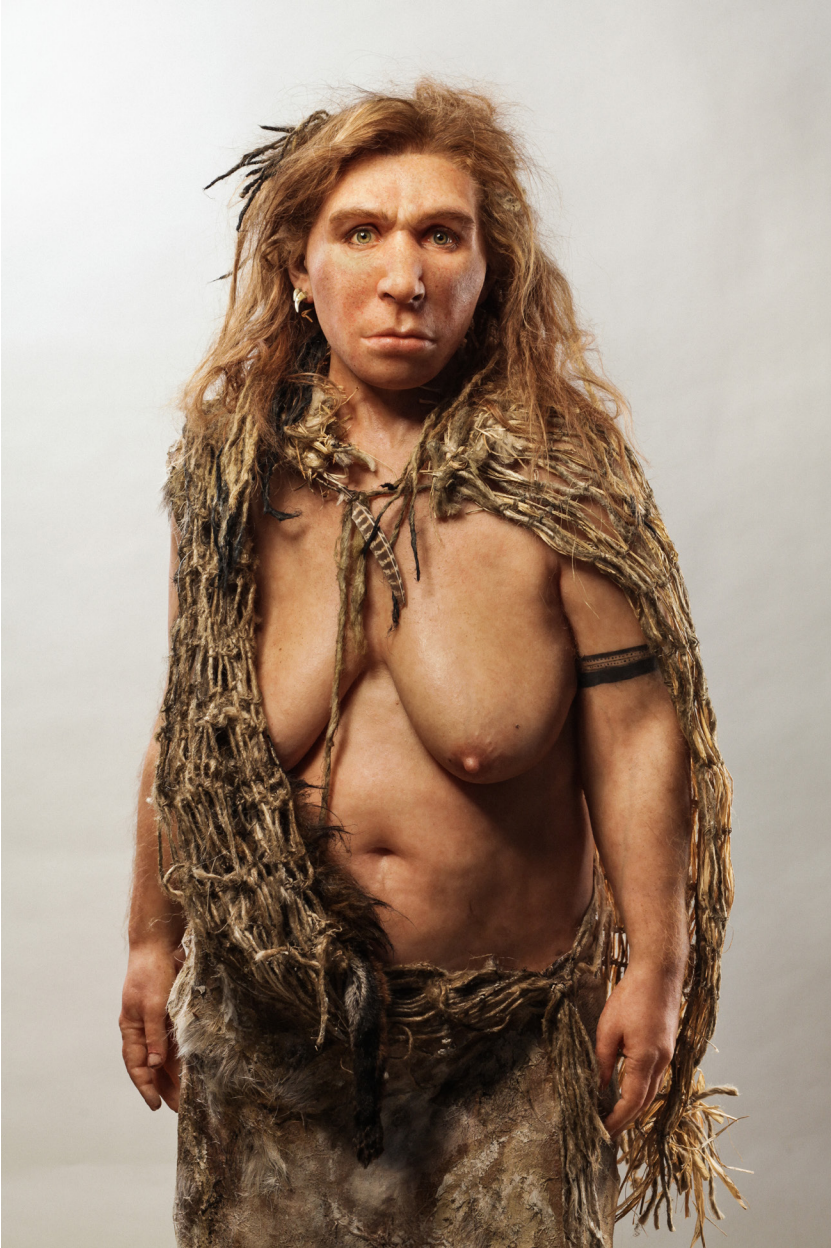
Figure 9.1: Recent reconstruction of a Neanderthal woman. Neanderthals were no less human, yet their physical and behavioural distinctions challenge our understanding of our relationship to these close cousins. Neanderthal Saint-Césaire © Sculpture: Elisabeth Daynes/Photo: S. Entresangle. Used with permission.