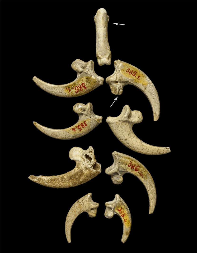
Figure 9.4: White-tailed eagle talons from the Krapina, dating to approximately 130,000 years ago. These talons are particularly significant as they seem to have been worn suspended as jewellery. Radovčić, Sršen, Radovčić, and Frayer. 2015. 'Evidence for Neandertal Jewellery: Modified White-Tailed Eagle Claws at Krapina.' PLoS ONE 10 (3): e0119802. DOI: https://dx.doi.org/10.1371/journal.pone.0119802 .