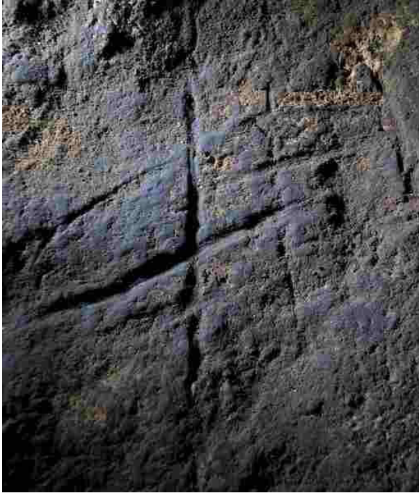
Figure 9.5: Neanderthal engraving in cross hatch shape found in Gorham's Cave, Gibraltar. AquilaGib (Stewart Finlayson, Gibraltar Museum), CC BY-SA 4.0, via Wikimedia Commons: https://commons.wikimedia.org/wiki/File:Neanderthal_Engraving_(Gorham%27s_Cave_Gibraltar).jpg .

From the first arrival of Upper Palaeolithic populations into and across Europe, their community relationships seem to be markedly different from those of the Neanderthals (see Table 9.1). They spread remarkably quickly into the region then occupied by Neanderthals around 40,000 years ago (Hoffecker 2009), soon reaching regions as far flung from their eastern entry through the Levant as southern Spain (Cortés-Sánchez et al. 2019) and Siberia (Douka et al. 2019). It is tempting to conclude that these populations were simply cleverer than previous ones, or more adaptable, but that many dispersals also failed, or were so risky as to be irrational rather than clever, argues that other distinctions were important. New motivations, and new types of social connection, are likely to have played an important role in motivations for this new level of mobility (see Spikins 2015).