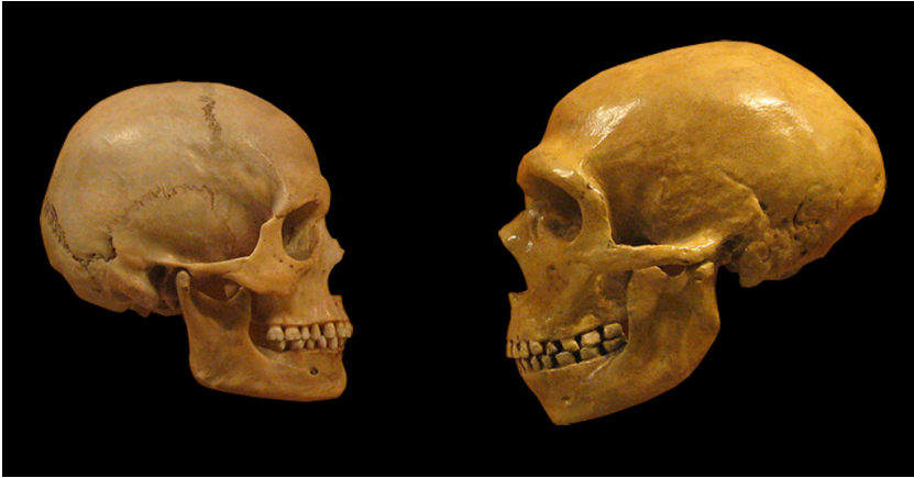
Figure 9.3: Neanderthal (right) and modern human crania (left), showing distinctive differences in cranial shape, robusticity, and presence/absence of a brow ridge.

In trying to explain why the material evidence for Neanderthal behaviour is different from that of the modern humans who replaced them, our attention has traditionally tended to focus on Neanderthal thinking skills. Particular attention has been paid to areas of Neanderthal cognition that might be seen as inferior to that of modern humans, in keeping with our assumption that our species ought to be cleverer than any others. Certainly, there is some evidence that Neanderthal thought and perception were different. There are a number of regions of modern human brains that seem to demonstrate potentially important differences from theirs (Bruner 2021). Differences in the parietal cortex may influence technical and visual cognition (Pereira-Pedro et al. 2020), for example, differences in the cerebellum may be significant in organisational skills (Kochiyama et al. 2018), and there may even be differences in body cognition (Bruner and Gleeson 2019). The idea that any differences, no matter how subtle, should imply human cognitive superiority seems somehow unsatisfactory, however (Hoffmann et al. 2018; Langbroek 2012; Zilhão 2014). Moreover, there tends to be little attempt to focus on where areas of Neanderthal cognition might have been superior. If we start by assuming that, in terms of their thinking skills, Neanderthals occupied a lower rung of an evolutionary ladder than modern humans, we