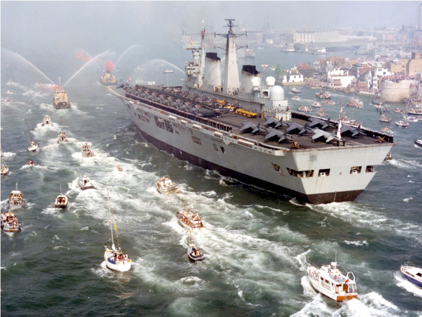
Figure 2.1: HMS Invincible returns to Portsmouth following the end of the Falklands War. Royal Navy, 1982. Crown Copyright: Open Government Licence.

programmes elegise aspects of British naval culture that had passed into history, the ‘Gunboat’ episode purposefully illustrates under-appreciated present-day political and economic realities, yet with historical dimensions. The constabulary and national roles he describes (‘Fishery protection may look simple, but it’s one of the trickiest jobs the Royal Navy has to do ... hemmed in by treaties and restrictions’) expand without apology to acknowledge an imperial history of worldwide presence and policing. The beleaguered nature of British maritime culture figures in his delivery through an implicit criticism of European fishing controls (bemoaning fishermen watching ‘their very livelihoods vanish’), contextualised by wider trends in the shrinkage of Britain’s merchant navy (‘eighty years ago the British fishing fleet, like the Royal Navy, was the biggest in the world’). A cross-fade from the present to black-and-white footage of Victorian-era fishing vessels seamlessly introduces further archive images of 19th-century gunboats regulating the empire, ‘on the river Tigris, showing the flag and showing who was boss’. Similar footage of the Yangtse prompts Hill-Norton to mention his own great-great-grandfather’s service on a gunboat during the Opium Wars. The danger (and justification) of Western powers’ embroilment in China is illustrated by the famous stories of USS Panay and HMS Amethyst . A cut from footage of HMS Amethyst ’s escape to