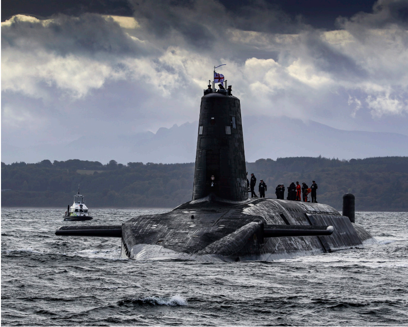
Figure 2.7: HMS Vanguard at Faslane. CPO Phot Nick Tryon, 2017. Crown copyright: Open Government Licence.

with little exploration of the personal views of the crew. Despite the camera's apparent freedom on board, the presenter's presence inhibits the grasp or directs the understanding of the subject. Bell's response to the experience of witnessing the deterrent in operation at the programme's end appears to substitute for, or even seek to direct, the viewer's own: