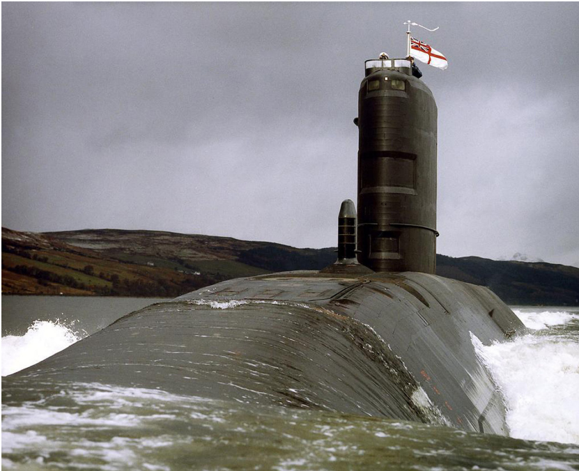
Figure 2.3: HMS Splendid . 1995.

The BBC's three-part series HMS Splendid (Figure 2.3) strongly recalls the format and approach of Submarine , in favouring an actorly voice-over (by David Suchet) over an overt interview format. As in the earlier series, members of the submarine crew speak to camera responding to unheard questions as they explain personal and professional aspects of life on board. Where Submarine revealed three distinct aspects of the service, HMS Splendid concentrates on a specific but again contemporarily illustrative mission: the titular submarine's selection and preparation to be the first Royal Navy warship to carry the American Tomahawk cruise missile system, and the successful completion of the first firing at a testing range in California in 1998. Used operationally by the US Navy during the Gulf War of 1991, and fired by the Royal Navy (from HMS