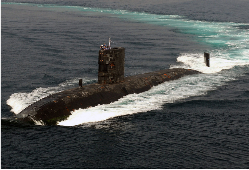
Figure 2.5: Trafalgar-class submarine. LA(Phot) Dan Rosenbaum, 2012. Crown copyright: Open Government Licence.

launching with ‘quiet methodical efficiency’. This episode ends with the skyline of the Libyan capital, Tripoli, seen on the horizon, now ‘in their periscope sights’. (This emotional peak, which has been manufactured without the need for Tomahawk launches (or their potential consequences) being addressed or articulated, dissipates anticlimactically in the next episode as the orders to fire are quietly rescinded.) Again, in contrast to the ambivalence of crew members towards Tomahawk in HMS Splendid , the ‘mixed feelings’ about its use noted amongst Turbulent’s crew are represented as not ‘mixed’ at all: some sailors express understandable excitement and a desire to do what the submarine is, after all, designed to do, and what they have trained to do, if they are called upon to fire. Nonetheless, the distance and significance of the submarine’s deployment encapsulate the conflicts and Navy commitments of the new millennium. HMS Turbulent’s captain notes that his boat is ‘the only Tomahawk shooter East of Suez’ and applauds the Navy’s capabilities and presence when a distant rendezvous takes place: ‘Gulf of Aden: British submarine, British helicopter, doing their jobs – quite incredible.’ When operational demands require the film crew to depart as Turbulent reaches the Arabian Sea, the voice-over pronounces: ‘our cameras may be leaving, but for Britain’s submariners, the mission never stops.’