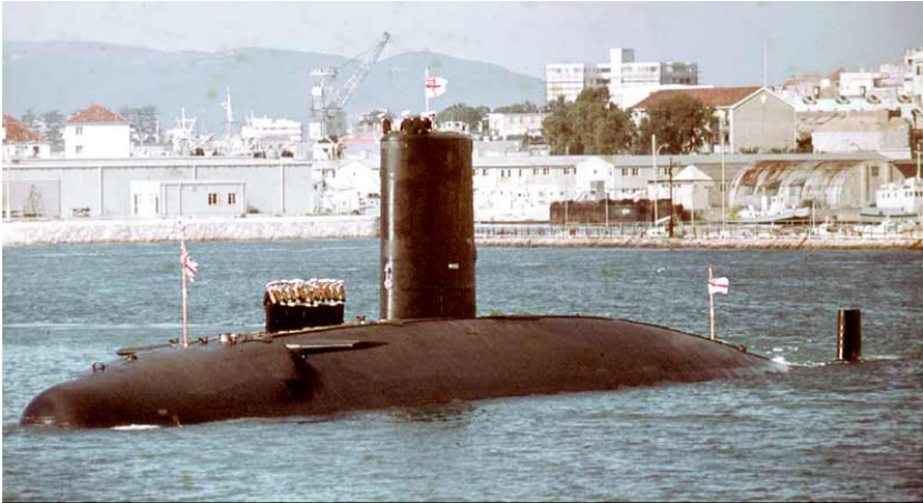
Figure 2.2: HMS Warspite. 1970.