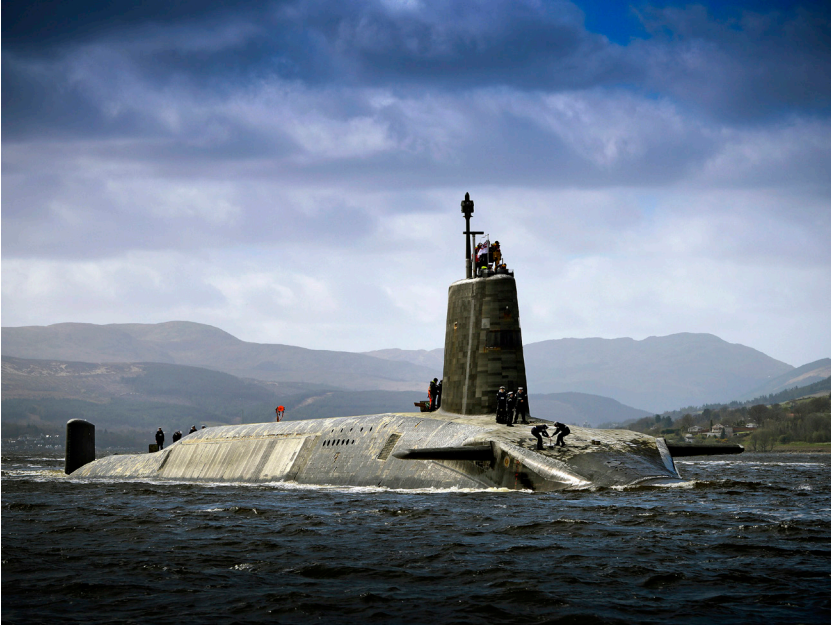
Figure 2.6: Vanguard -class Trident missile submarine.

series do take note of details of service life (in disciplinary proceedings and the humorous and mundane experiences on board), they represent a diminished and de-emphasised proportion of the programmes in comparison to the duration and stylisation devoted to documenting (or manufacturing) action, tension and crises. In addition to prominent style, a renewed but distinct socio-political emphasis is obvious in their (and the Warship series') overt concentration on present operations, distant deployments and tangible threats to British ships and Britain itself. The distance from the static dread of the Cold War in Submarine to the newly heightened confrontations of the 21st century in political and televisual terms is demonstrated by the differences exhibited by On Board Britain's Nuclear Submarine: Trident (Figure 2.6).