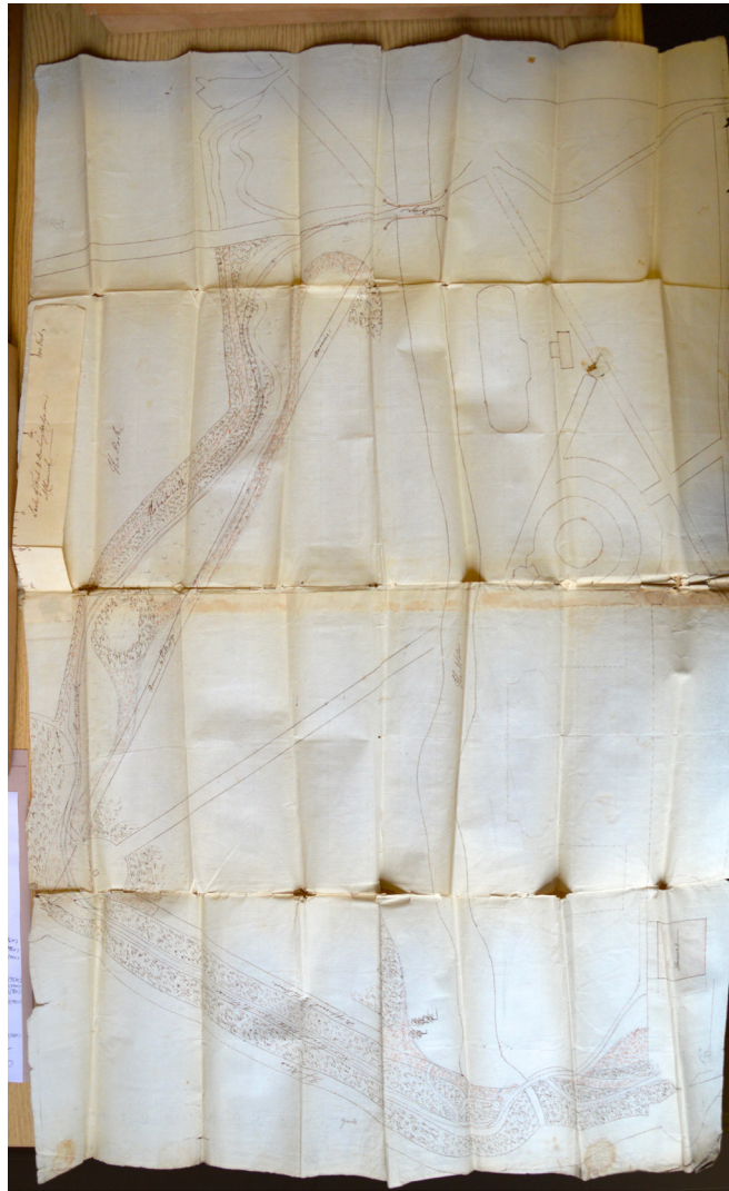
Figure 7.4: Proposals plan, Chiswick, Samuel Lapidge, 1784 , covering the area of the western perimeter of the pleasure ground included a specification and plan. The plan included proposals superimposed on the existing layout and was folded in a similar manner and size to other correspondence.

Walk, intirely hideing it as an Avenue and making the face of it, as marked out upon the Ground, which is intended as a very proper line of Planting to be looked against from out of the New Gravel Walk. Fresh Earth may be wanted for the above Plantations & Levels of the Ground. The Quantity of Gravel required for the New Gravel Walk will be about 350 Loads– The Quantity of Earth is quite uncertain, as Expenses may be saved in this Article. 34