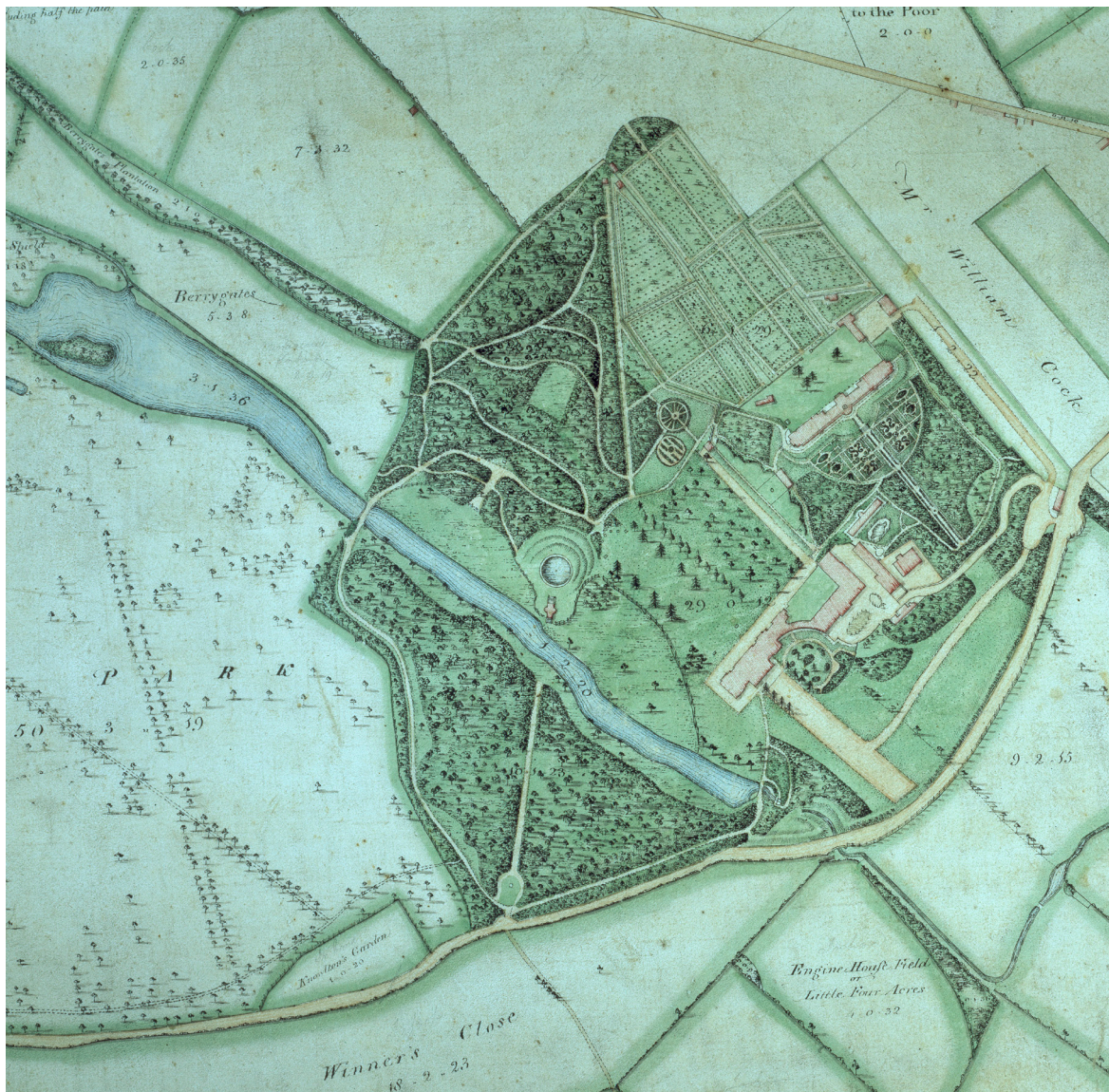
Figure 7.5: Detail of Map of Chiswick , Peter Potter, 1858. The area covering the western perimeter (to the south west of the pleasure grounds) of the Chiswick estate reveals that Lapidge's design had been executed as proposed. While one of the axes had been retained here, other avenues had been eliminated.

wall being raised by Matthew Wright, and completed on the 16 th November, after which this area was planted primarily with large trees, including twenty planes, six acacias, and twenty limes, and with shrubbery planting including six Swedish junipers, sixteen laurustinus, six lignum vitae, six sweet bays, ten Spanish brooms, twenty broad-leaved phillyrea and six old ones, six myrtle-leaved phillyrea, six guelder roses, twenty lilacs, twenty privets, and ten yews. 42 These were all supplied by Robert Lowe, Lapidge's brother-in-law, on the 8 th December. Further supplies of plants by Greenwood, Hudson, and Barrit on the 15 th January, Robertson and Hodgson on the 24 th , and more from Greenwood et al. on the 25 th indicate the progress, while the later sections were planted with material from George and James Mitchelson on the 14 th April and Mess. Ronalds and Sons in April and May 1785 (Figure 7.5).