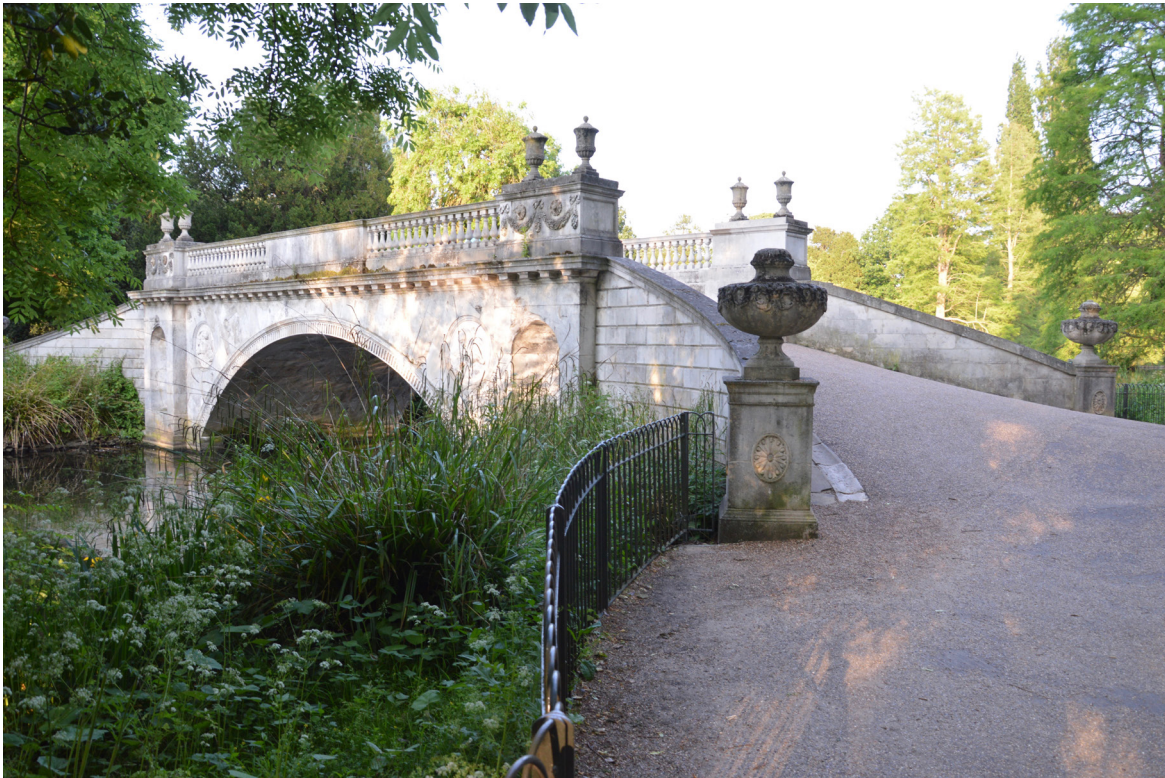
Figure 7.3: The Classical Bridge, Chiswick. In 1774 the Duke of Devonshire replaced the timber Palladian bridge with the Classical Bridge, suggesting his intention for further improvements to the grounds.

to the site, staking out the proposals ‘to shew His Grace the Walks & Planting &c &c’ and provided a written description of the intended alterations that also explained the reasoning behind the proposals. It was received by Heaton on the 8 th of October: