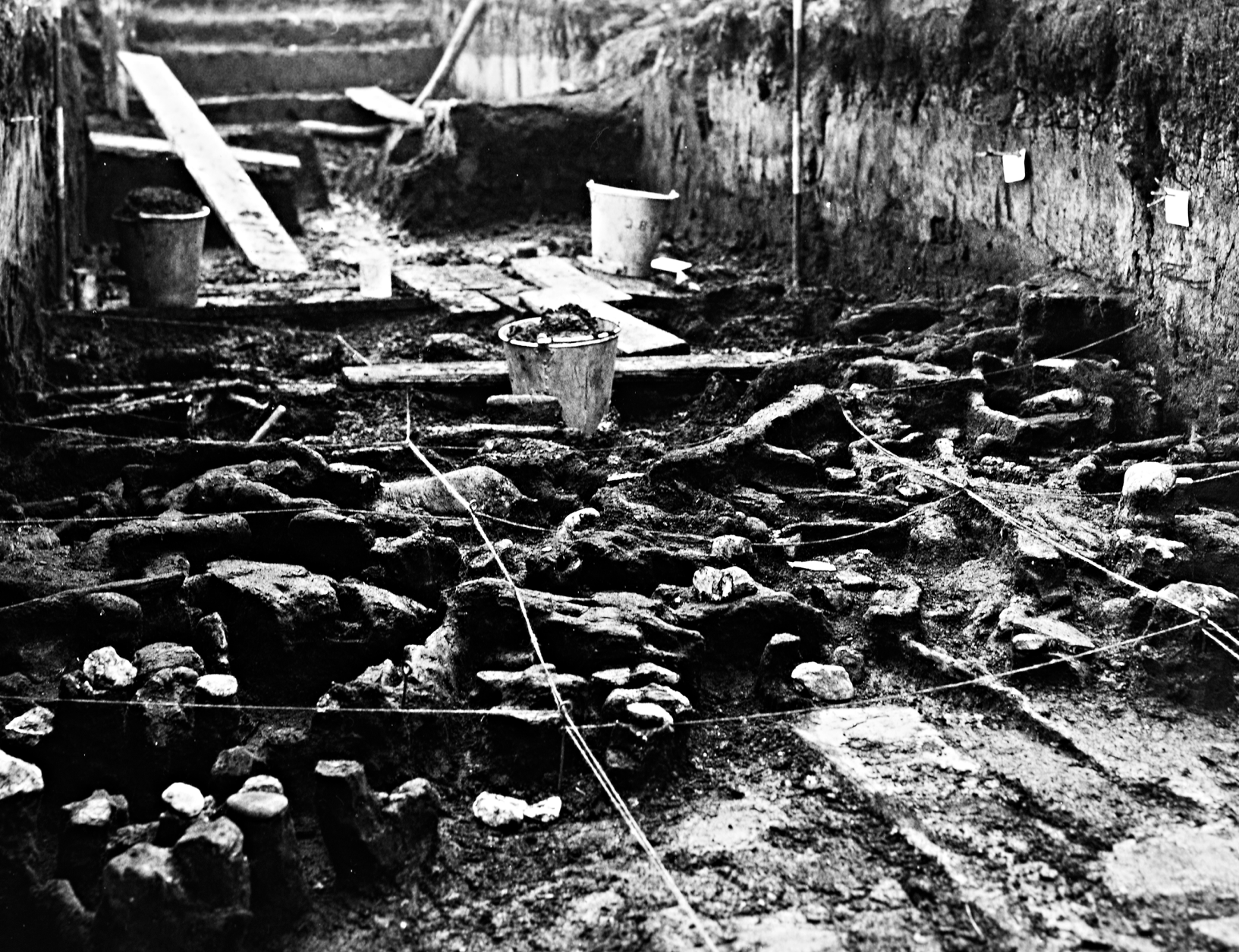
Figure 1.2: Excavations at Star Carr by Clark.