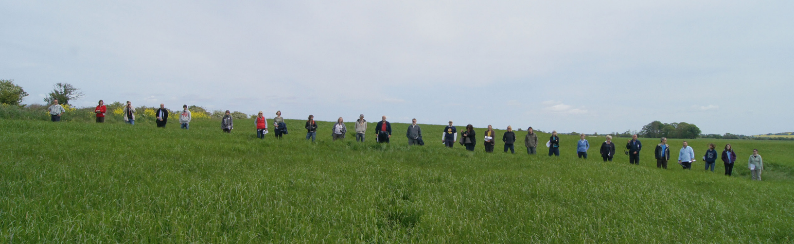
Figure 1.3: The field had been flat in the 1980s but deterioration of the deposits resulted in peat shrinkage and the topography of the field became evident, as shown here.

field in the 1980s was sloping and had begun to show undulations (Figure 1.3). Confirmation that the deposits were drying out to the detriment of the archaeology came in the early years of the project. Small-scale excavation within the wetland areas showed that the local water table had fallen below the level of the main artefact horizons and that organic material, such as bone and antler, was now very poorly preserved (Milner 2007).