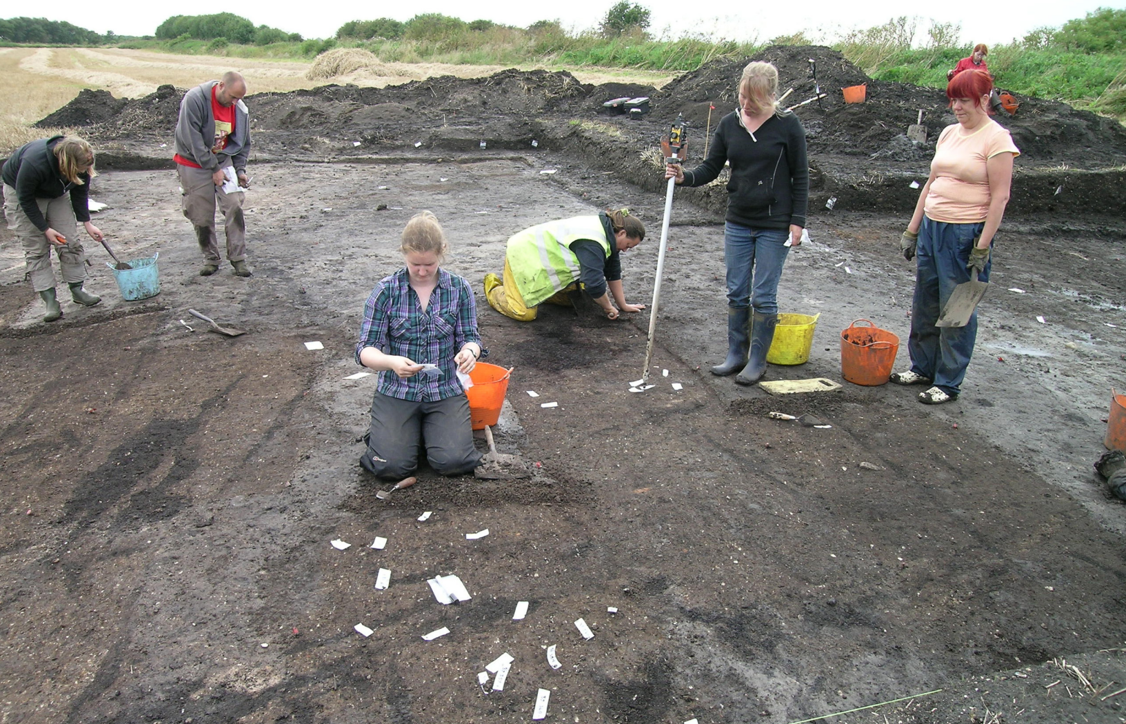
Figure 15.2: Tagging flint and recording it using a total station (Copyright Star Carr Project, CC BY-NC 4.0).

guidelines for the treatment of waterlogged wood (Brunning and Watson 2010) and recommendations made by the Society of Museum Archaeologists (1993) for the retention of waterlogged wood. Each discrete item was recorded individually using a pro forma wood recording sheet, based on the sheet developed by Fenland Archaeological Trust for the post-excavation recording of waterlogged wood. Every effort was made to refit broken or fragmented items. However, due to the nature of the material, the possibility remains that some discrete yet broken items may have been processed as their constituent parts as opposed to as a whole. The system of categorisation and interrogation developed by Taylor (1998a; 2001) has been adopted for the work reported in this volume.