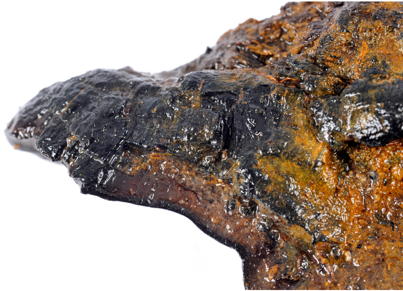
Figure 31.3: Close-up photograph of a charred Fomes fomentarius specimen that is likely to have been initially removed from the original fruit (Photograph taken by Paul Shields. Copyright University of York, CC BY-NC 4.0).