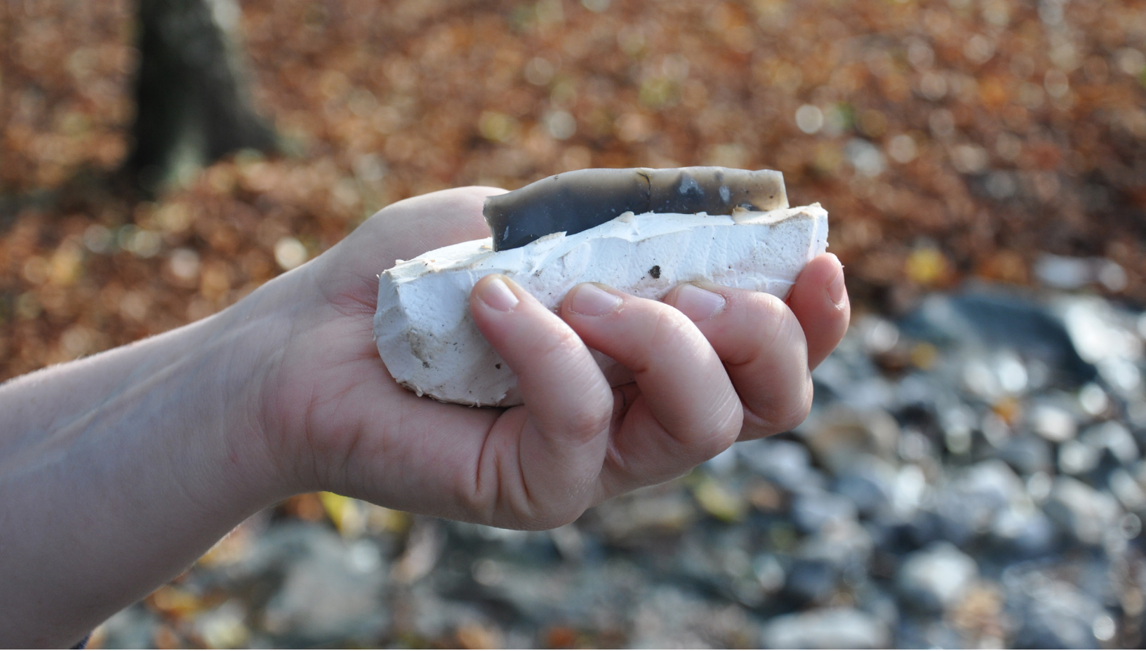
Figure 31.6: Photograph showing a blade that has been hafted in the inner fruit of a birch polypore.

It has also been documented that the First Peoples of British Columbia would transport the flesh of polypores for use as tinder within clam shells, cedar bark, or birch bark rolls (Turner 1998), whilst the flesh from another polypore (agarikon), Laricifomes officinalis (Kotlaba and Pouzar 1957), has in the past been used as a purgative (Deur and Turner 2005) or as shaman grave guardian figures (Kroeger et al. 2012).