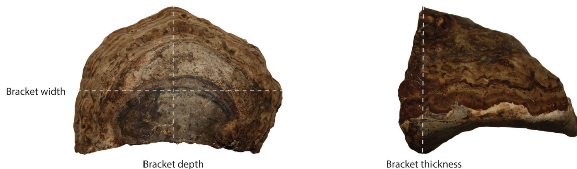
Figure 31.1: Photograph of a modern Fomes fomentarius specimen showing the measurements that were undertaken.

In total, 82 fungi were identified. Of these, 81 were derived from the more recent excavations undertaken at the site (Table 31.1). The other specimen was retrieved from Clark’s backfill by David Lamplough, a local volunteer, and gifted to the University of York in 2013.