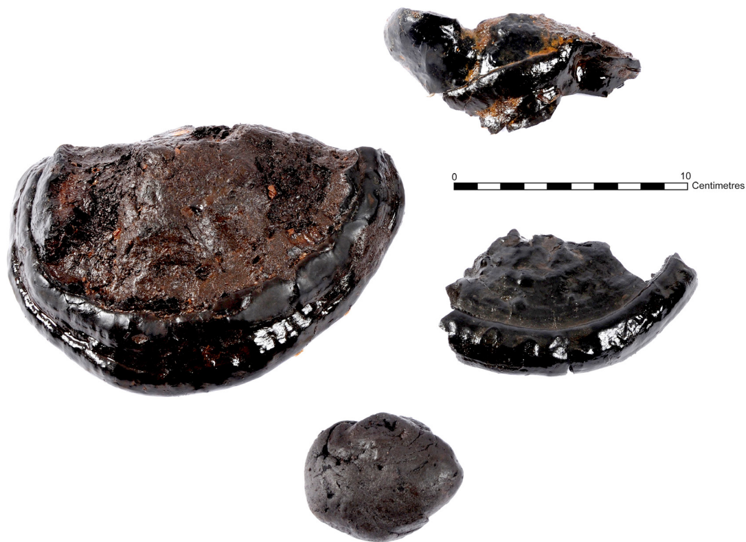
Figure 31.2: Photograph showing the three different species of fungus that were identified in the assemblage. Clockwise from top right: burnt Fomes fomentarius specimen, the one Phellinus igniarius specimen, the one Piptoporus betulinus specimen and a larger and modified Fomes fomentarius specimen that has had its outer surface intentionally removed (Photograph taken by Paul Shields. Copyright University of York, CC BY-NC 4.0).